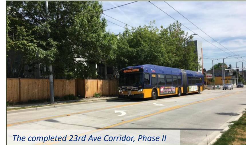
The completed 23rd Ave Corridor, Phase II