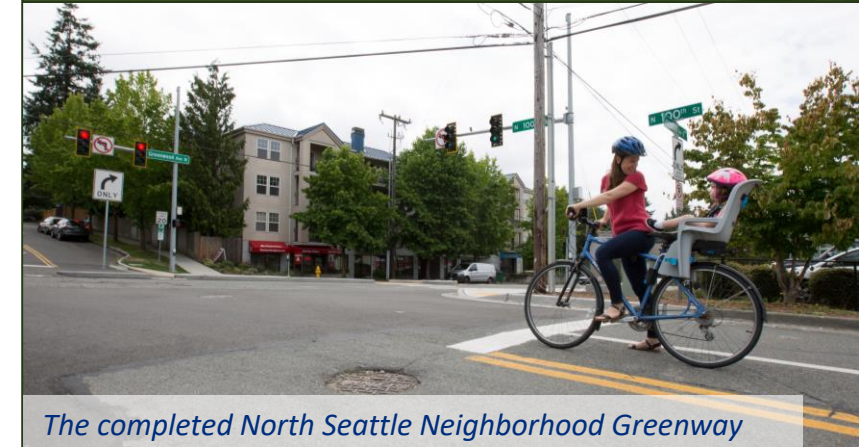
The completed North Seattle Neighborhood Greenway