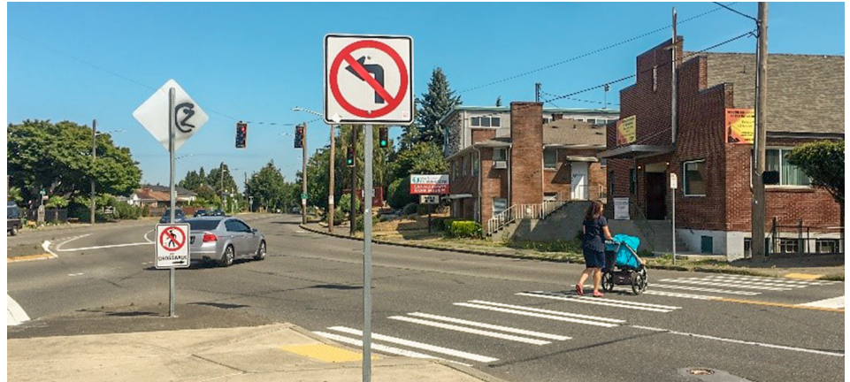
Safety improvements will be made at the intersection of 15th Ave S, S Columbian Way, and S Oregon St.

15th Ave S between S Spokane St and S Angeline St provides an important connection for people traveling in and through Beacon Hill. SDOT is making improvements in this corridor that balance the needs of all users so that everyone can get where they need to go safely and conveniently.