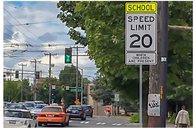
Existing school zone signage on 12th Ave S

We're improving visibility for people walking and biking around the intersection of S Washington St and 14th Ave S and promoting identification of the Bailey Gatzert Elementary school zone. In 2016, the Bailey Gatzert Elementary Pedestrian Improvements project was one of 12 selected by the Levy to Move Seattle Oversight Committee to be funded through our Neighborhood Street Fund (NSF) program. The NSF program funds projects requested by the community.