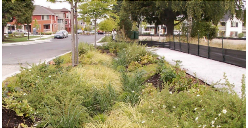
Figure 2. A completed natural drainage system