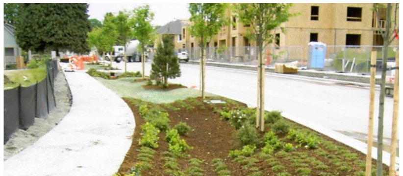
Figure 3. A newly planted natural drainage system